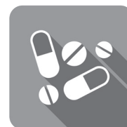
Healthcare & Bio-Science