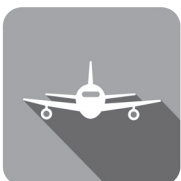
Defense & Aerospace