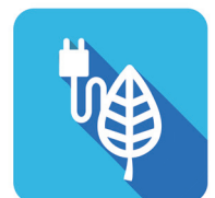
Energy & Environment